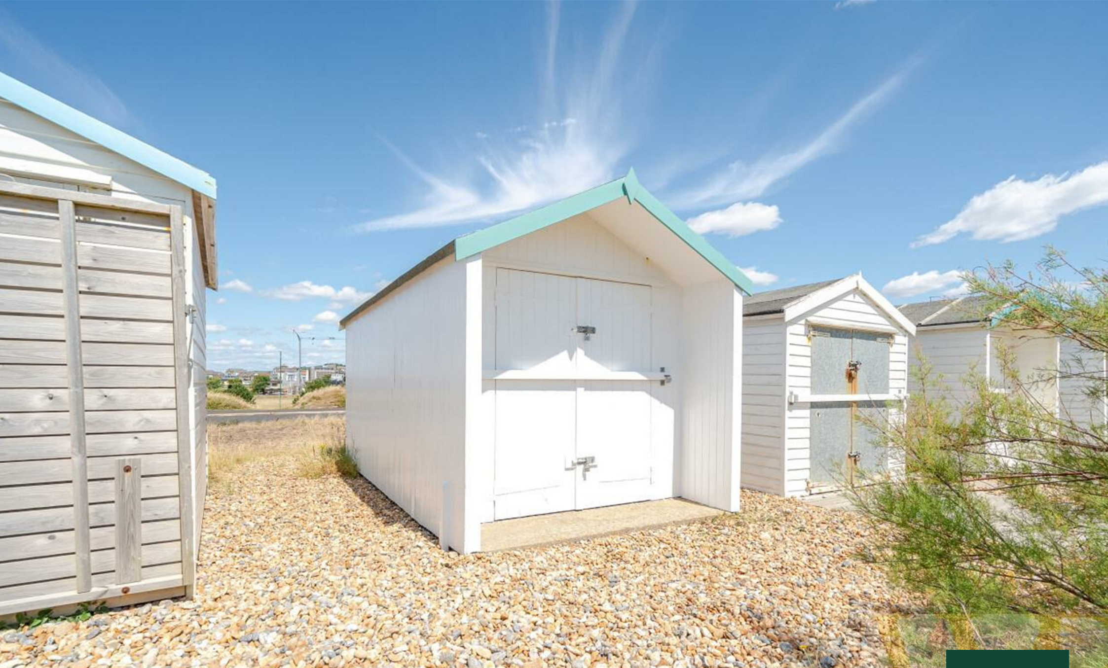
Beach Hut 40 Beach Green | | Shoreham-By-Sea | BN43 5YE